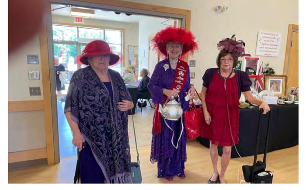
IODE Captain Hooper Chapter, Carleton Place