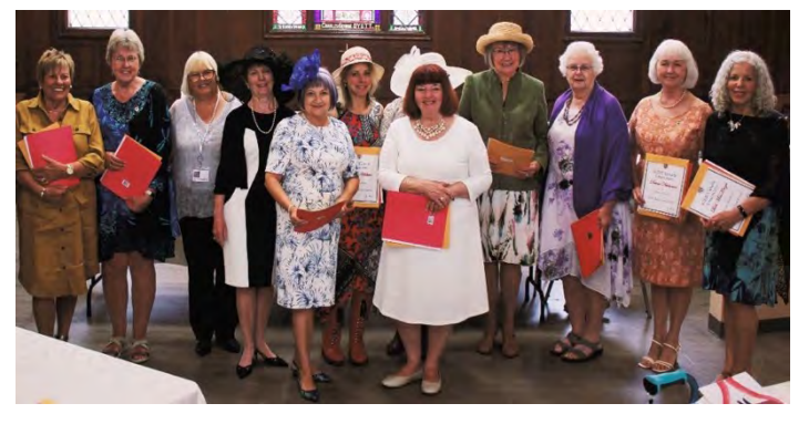
14 recipients for 5 year pins