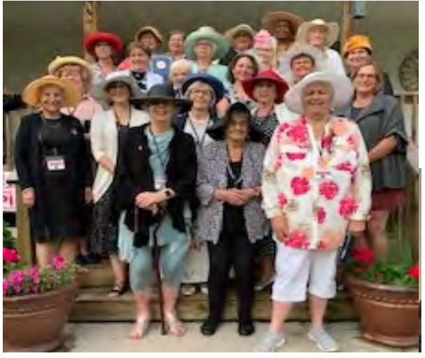
IODE Val Griffiths Chapter, Dorchester