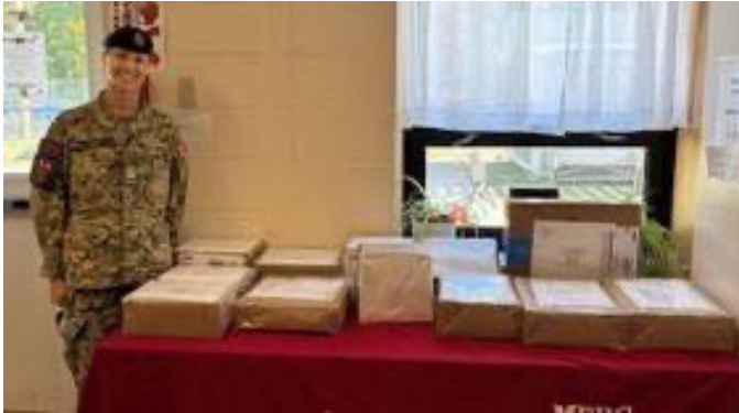
Lindsay Lake, a member of IODE 48th Highlanders Chapter , Toronto, is shown with deployment packages she assembled, which included copies of Echoes . These packages were sent to members of the Canadian Armed Forces currently deployed outside Canada. Lindsay is stationed in Gagetown, NB.