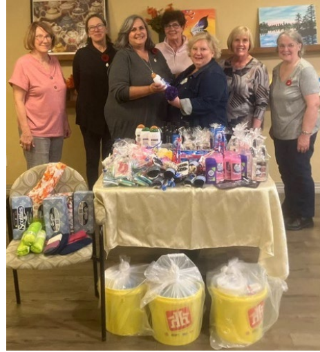
The Captain Hooper Chapter , Carleton Place, selected Lanark County Interval House and Community Support as their 125 th Anniversary recipient. Members generously donated more than 125 comfort and care items for the women and children staying in the shelter — including personal care essentials, warm cozy items, treats to brighten someone's day, and thoughtfully prepared "moving out kits" filled with household necessities to help women feel supported as they transition to a safer home. These items will provide comfort, dignity, and a sense of home to women of the shelter.