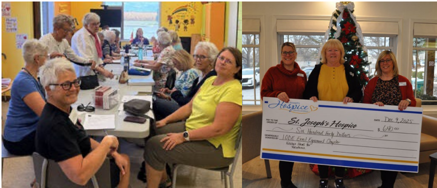
Members of IODE Errol Egremont Chapter , Sarnia, took a moment to spread holiday cheer by signing Christmas cards for Canadian military and a donation for the Hospice to be used for basic kitchen equipment – skillet, silicone pot covers, etc.