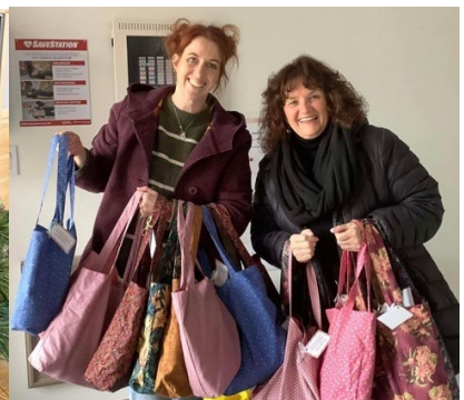
IODE Maple Leaf Chapter , Goderich creating greenery baskets and delivery of 20 comfort bags for women to receive when they first come into care at the Huron Women's Shelter. These hand sewn bags contain two knitted facecloths, hand towel, slippers, soap, journal and pen.