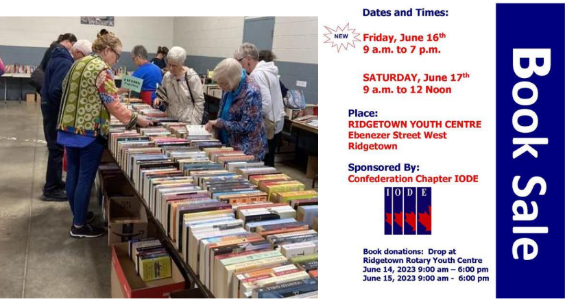
Confederation Chapter, Ridgetown Book Sale