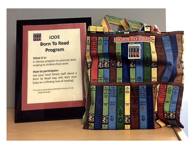
Bemersyde Book Bags