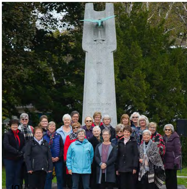
IODE Confederation Chapter, Ridgeway