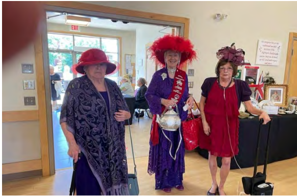
IODE Captain Hooper Chapter, Carleton Place