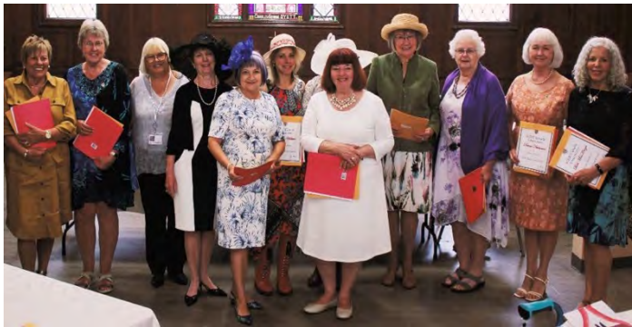
14 recipients for 5 year pins