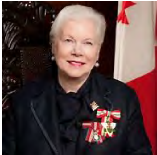
View Her Honour, Elizabeth Dowdeswell's Video PAM greetings on the Provincial website: www.iodeontario.ca