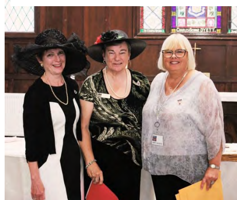
IODE Maple Leaf Chapter, Goderich