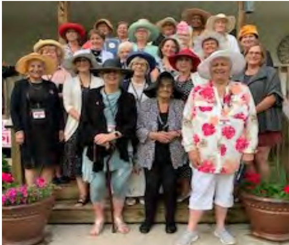
IODE Val Griffiths Chapter, Dorchester