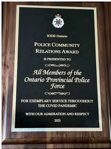
2022 OPP Community Relations Award Plaque