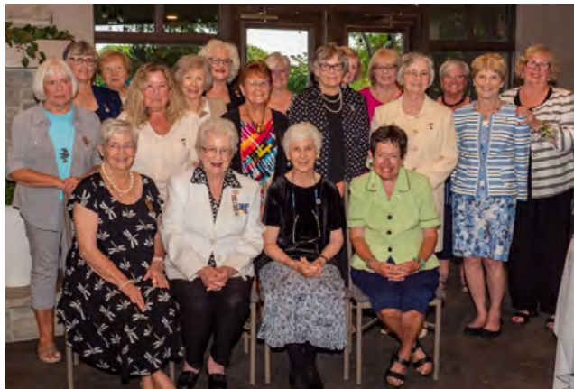
Happy 60+ Anniversary