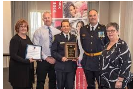
2019 IODE Police Community Relations Recipient