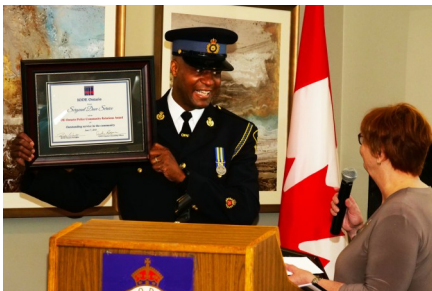
2018 IODE Police Community Relations Recipient

The expenses associated with awarding the IODE Police Community Relations Award are reliant on the generosity of primary chapter members. To ensure this award can continue to be offered to a well deserving member of the OPP, I am asking primary chapters to consider a contribution to the Provincial Citizenship Fund .